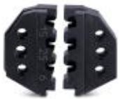
Spare die for CRIMPFOX-SC 6

Replacement die - CRIMPFOX-SC 6/DIE - 1212051