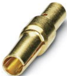
Crimp contact, turned, Single contact, contact diameter: 1 mm, crimp range: 0.14 mm 2 ... 0.56 mm 2

Please be informed that the data shown in this PDF Document is generated from our Online Catalog. Please find the complete data in the user's documentation. Our General Terms of Use for Downloads are valid ( http://phoenixcontact.com/download )