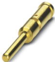
Crimp contact, turned, contact diameter: 2 mm, crimp range: 2.5 mm 2 ... 4 mm 2

Please be informed that the data shown in this PDF Document is generated from our Online Catalog. Please find the complete data in the user's documentation. Our General Terms of Use for Downloads are valid ( http://phoenixcontact.com/download )