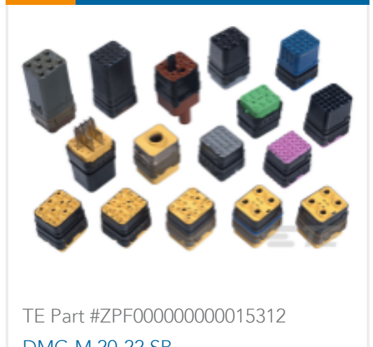
DMC-M 20-22 SB