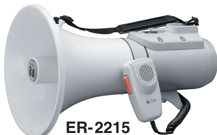
ER-2215 23W max.