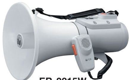
ER-2215W 23W max. with Whistle