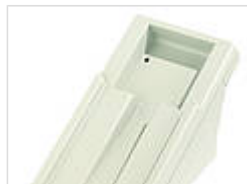
Table stand BOS 900-903 / BOS 910-913