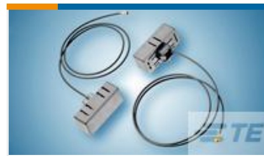
TE Part #1513472-1 UAM Assembly