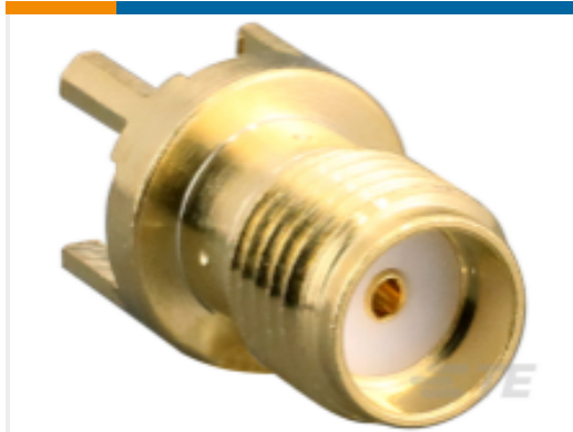
TE Part #CONSMA001-C-G SMA Jack 50 Ohm PCB Through Hole