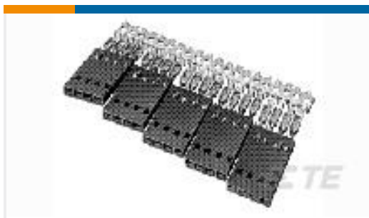
TE Part #5-103976-3 5X4 MTE RCPT SR PLAIN .100CL