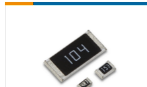
TE Part #1-2176339-7 CRGCO 0603 220R 1%