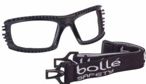
Foam and strap