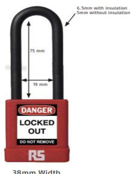
38mm Width 74/76