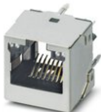
RJ45 PCB connectors, type: RJ45, degree of protection: IP20, number of positions: 8, 10 Gbps, connection method: THR solder connection

Please be informed that the data shown in this PDF Document is generated from our Online Catalog. Please find the complete data in the user's documentation. Our General Terms of Use for Downloads are valid ( http://phoenixcontact.com/download )