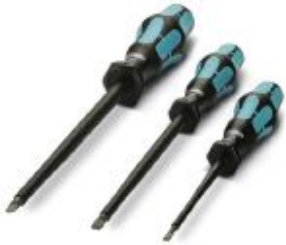
Screwdriver range, consisting of the three small screwdrivers: SZS 1.0 x 4.0, SZS 1.0 x 6.5, SZG 0.9 x 6.5

Please be informed that the data shown in this PDF Document is generated from our Online Catalog. Please find the complete data in the user's documentation. Our General Terms of Use for Downloads are valid ( http://phoenixcontact.com/download )