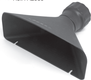
Large Rectangular Nozzle for Fume Extractor Ref. FAE082