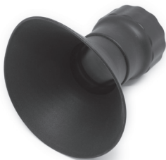
Round Nozzle for Fume Extractor Ref. FAE081