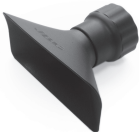
Rectangular Nozzle for Fume Extractor Ref. FAE080

You can replace the supplied nozzle and choose the one that best suits your needs.