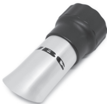
Metal Round Nozzle for Fume Extractor Ref. FAE083