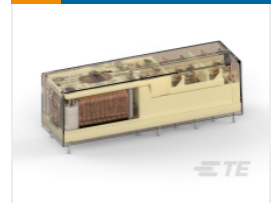
TE Part # CAT-SCH691-SR1B Forced Guided Relay, Reinforced Insulate