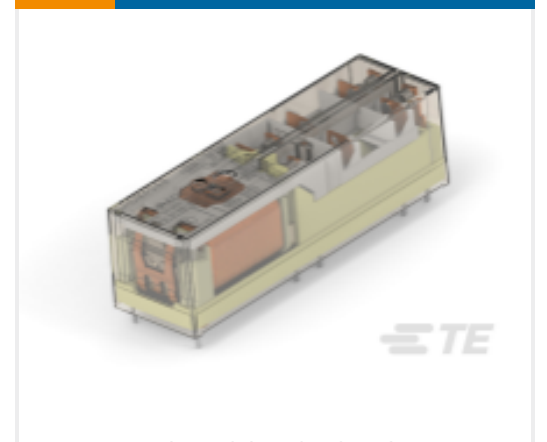
TE Part # CAT-SCH691-SR1C Force Guided Relay, High Insulation