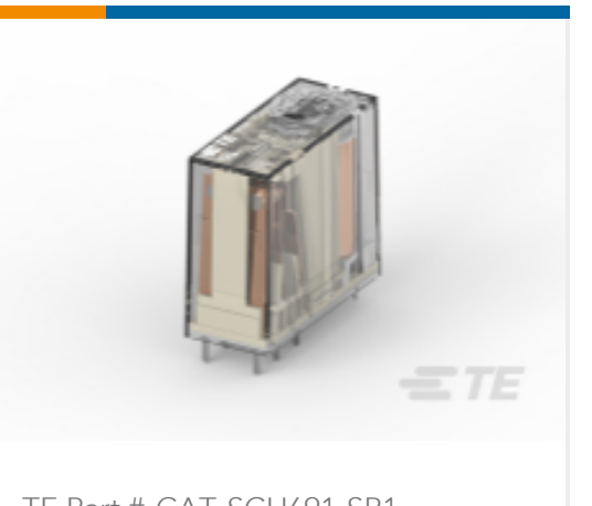
TE Part # CAT-SCH691-SR1 Force Guided Power Relay, 2 Poles