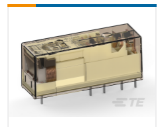
TE Part # CAT-SCH691-SR1A Force Guided Power Relay, 4 Poles