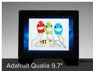
Adafuit Qualia 9.7"