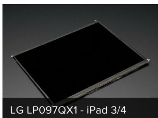
LG LP097QX1 - iPad 3/4