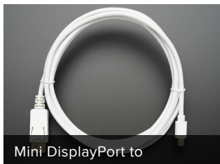
Mini DisplayPort to