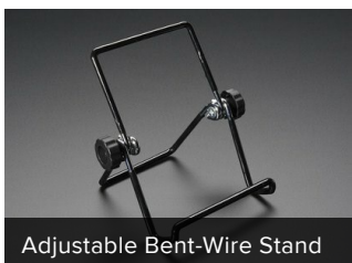
Adjustable Bent-Wire Stand