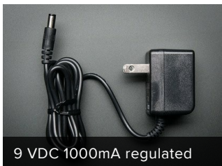
9 VDC 1000mA regulated