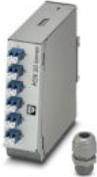
DIN rail splice box, fully mounted ready to splice, for 6x LC duplex (OS2)

Please be informed that the data shown in this PDF Document is generated from our Online Catalog. Please find the complete data in the user's documentation. Our General Terms of Use for Downloads are valid ( http://phoenixcontact.com/download )