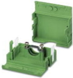
Cable housing, pitch: 0 mm, number of positions: 5, dimension a: 25 mm, color: green

Please be informed that the data shown in this PDF Document is generated from our Online Catalog. Please find the complete data in the user's documentation. Our General Terms of Use for Downloads are valid ( http://phoenixcontact.com/download )