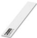
Marker for terminal blocks, Card, white, unlabeled, can be labeled with: CMS-P1-PLOTTER, perforated, mounting type: snap into tall marker groove, snap into flat marker groove, for terminal block width: 7.5 mm, lettering field size: 15 x 7.5 mm

Marker for terminal blocks - SBS 2,5/7,5 - 1007604