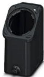
HEAVYCON EVO sleeve housing, plastic, with bayonet flange for EVO screw connection, B10, for single locking latch, height: 87.5 mm, without EVO screw connection

Please be informed that the data shown in this PDF Document is generated from our Online Catalog. Please find the complete data in the user's documentation. Our General Terms of Use for Downloads are valid ( http://phoenixcontact.com/download )