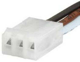
Wire Harness Wire harness for SCHURTER products