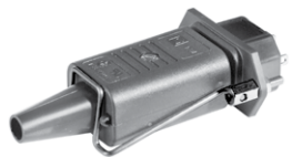
Cord retaining kits Cord retaining strain relief