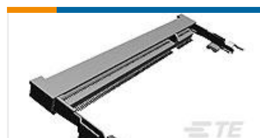
TE Part #1473150-4 SEMI-HARD TRAY ASSY DDR2 SODIMM 5.2H RV