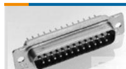
TE Part #443975-5 AMPLIMITE,RCPT ASY,POSTD,109,5