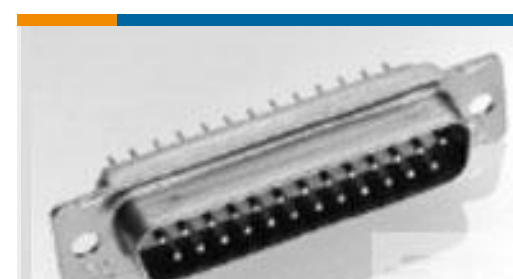
TE Part #443975-4 AMPLIMITE,RCPT ASY,POSTD,109,4