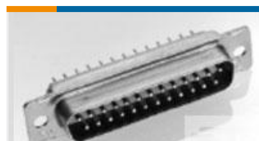
TE Part #443975-2 AMPLIMITE,RCPT ASY,POSTD,109,2