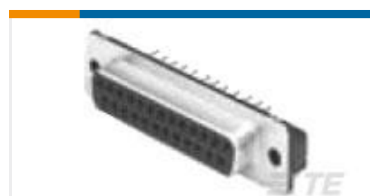
TE Part #1-5747150-4 09 RCPT SP/FMS SCRLK