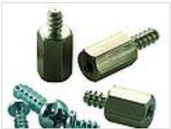
Screws (SHR) and distance bolts (DIBLZ) for mounting bosses in plastic enclosures