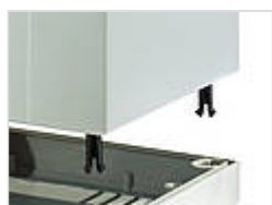
Quick-release fastener for EG 12.. - 20.., polyamide