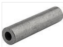
Press-in tool for EG-SV