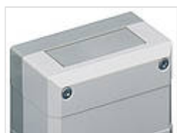
Lid fixing set from above for EG 12.. - 20..