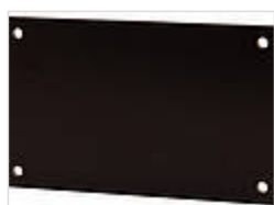
Mounting panel, laminated paper