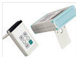
Universal clip and tip-up clip