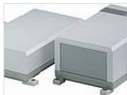
Wall brackets, ABS