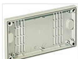
Covers for keyhole suspension