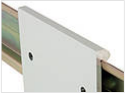
Metal top hat rail adapter for DIN rail DIN EN 60715 TH 35