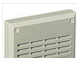
Screw cover, ABS