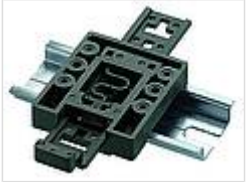
Universal DIN rail holder TSH 35, polyamide