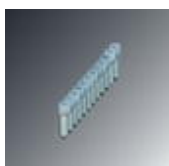
Fixed bridge, Number of positions: 12, Color: silver