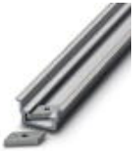
DIN rail, deep drawn, high profile, unperforated, 1.5 mm thick, material: aluminum, height 15 mm, width 35 mm, length 2000 mm

DIN rail, unperforated - NS 35/15 AL UNPERF 2000MM - 1201756