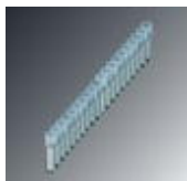
Fixed bridge, Number of positions: 20, Color: silver