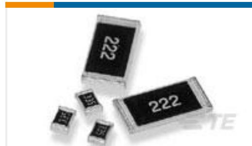
TE Part #1623489-1 CRG1206 1% 33K