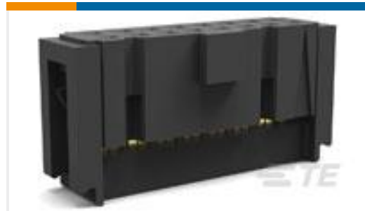
TE Part #1658527-6 622-1630LF FEM SOCKET, LEAD FREE