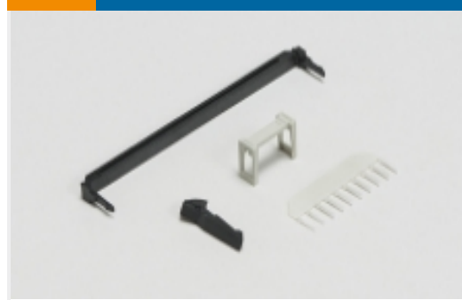
Ribbon Connector Accessories(2)