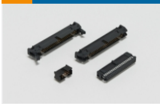
Ribbon Cable Connectors (59)