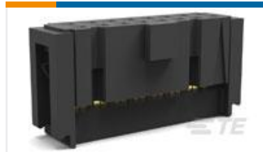
TE Part #1658527-9 622-2630LF FEM SOCKET, LEAD FREE