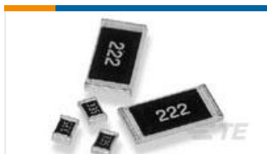
TE Part #1623417-1 CRG1206 1% 12K