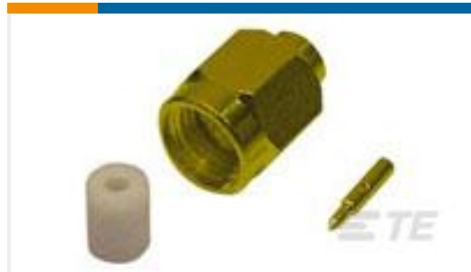
TE Part #1-1478904-0 SMA STR PLG DS RG405 GSS