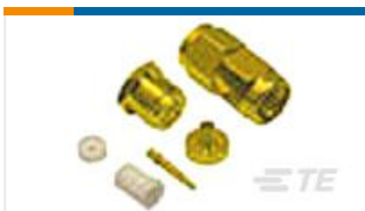
TE Part #1-1478908-0 SMA STR PLG S/CLMP RG174 GSS