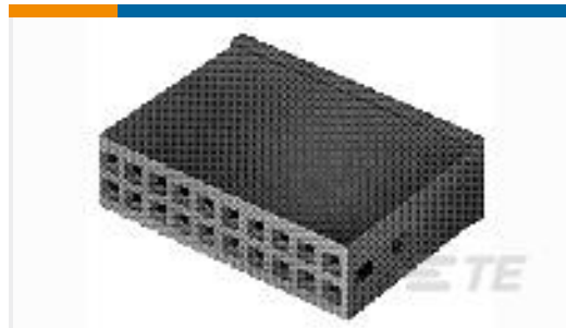
TE Part #926209-5 LOCKING CLIP HSG.