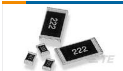
TE Part #1623428-1 CRG1206 1% 15K