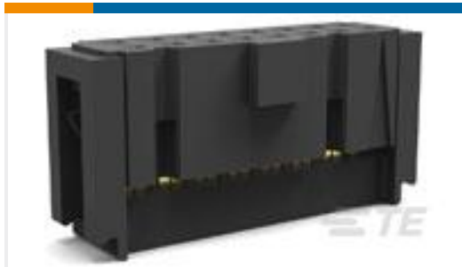
TE Part #1658527-3 622-1030LF FEM SOCKET, LEAD FREE