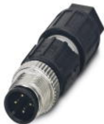
Sensor/actuator connector, Universal, 4-position, Plug straight M12, A-coded, Insulation displacement connection, knurl material: Zinc die-cast, nickel-plated, external cable diameter 3.5 mm ... 6 mm

Please be informed that the data shown in this PDF Document is generated from our Online Catalog. Please find the complete data in the user's documentation. Our General Terms of Use for Downloads are valid ( http://phoenixcontact.com/download )