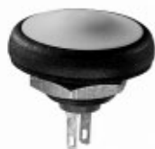
Threaded bushing IFS3Z1AD NO