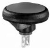
Snap-in IFB3Z1AD NO