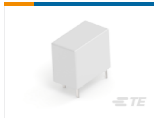
TE Part #2071398-4 OJ-SS-112HM6,00000