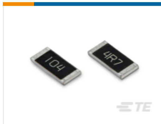
TE Part #3-2176456-9 CPF 0603 2R49 0.1% 25ppm 1K RL