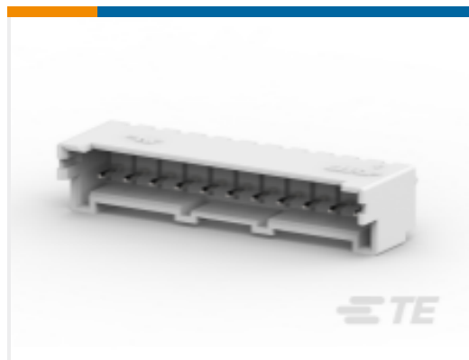
TE Part #1-1969730-1 EP2.5 SHROUDED HDR ASSY 11P VERTICAL