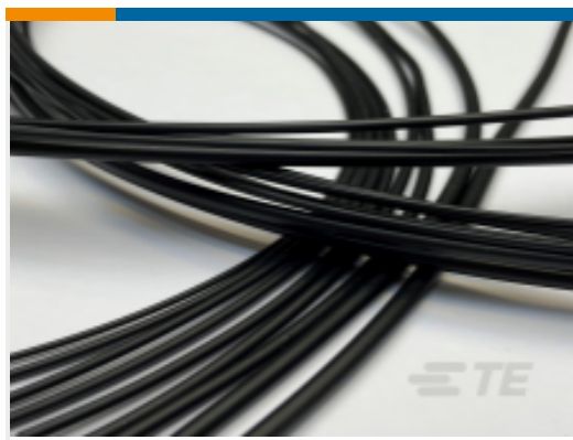
TE Part #2340818-1 RL0111-1.50-9