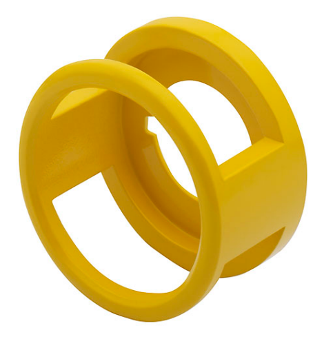
Attention: The preview is based on a sample product. This can differ from your current configuration.