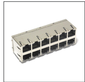
Gigabit Magnetic 12-Port (2x6) Ganged RJ45 Jack with LEDs

85727 2x4, Gigabit Magnetic RJ45 with LEDs