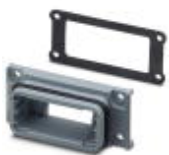
D-SUB panel mounting frame, shell size 1, IP67 degree of protection

D-SUB panel mounting frames - VS-09-A - 1688366