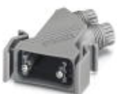
D-SUB sleeve housings, degree of protection: IP67, material: PA, cable outlet: Angled, size of housing: 1, color: gray

D-SUB sleeve housings - VS-09-T-2M16 - 1688353