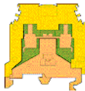
Terminal block for ground wire