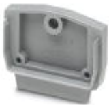
End cover, Length: 32 mm, Width: 4 mm, Color: gray