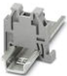
Snap-on end bracket, to be snapped onto NS 15 DIN rail