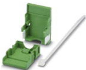
Cable housing, pitch: 3.81 mm, number of positions: 3, dimension a: 13.82 mm, color: green

Please be informed that the data shown in this PDF Document is generated from our Online Catalog. Please find the complete data in the user's documentation. Our General Terms of Use for Downloads are valid ( http://phoenixcontact.com/download )