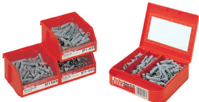
Stacking box ST