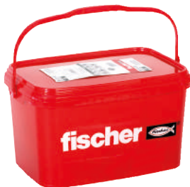
S in bucket