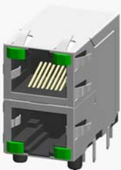
P/N RJSAE-5383-02 SHOWN STACKED 2X1, 8 POSITIONS, WITH SHIELD AND LEDs