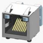
P/N RJSSE-5081 SHOWN SINGLE PORT, 8 POSITION