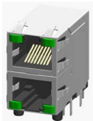
P/N RJSAE-5383-02 SHOWN STACKED 2X1, 8 POSITIONS, WITH SHIELD AND LEDs