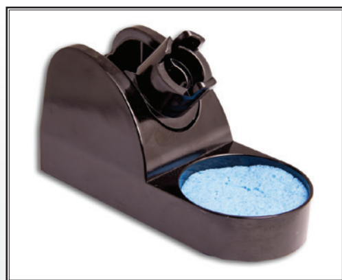
Safety Stand ST6A