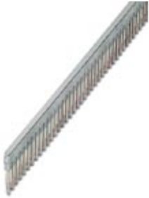
Plug-in bridge, pitch: 5.2 mm, number of positions: 50, color: gray

Please be informed that the data shown in this PDF Document is generated from our Online Catalog. Please find the complete data in the user's documentation. Our General Terms of Use for Downloads are valid ( http://phoenixcontact.com/download )