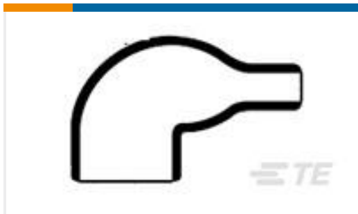
TE Part #178086-000 222A111-25/86-0