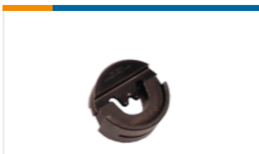
TE Part #1-1490413-4 NEST, 90 DEG SOLISTRAND, 8