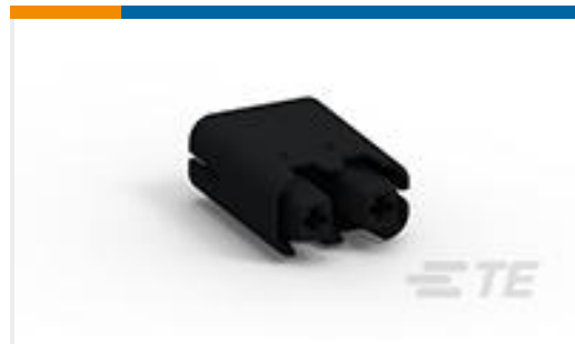
TE Part #1587977-2 INNER HOUSING, PLUG, HVA280-2PHM, PASS T