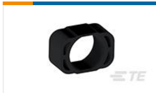
TE Part #2103153-1 SPACER, HVA280-2PHM