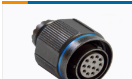
TE Part #YDTS26W17-26PNC001 PLUG ASSY