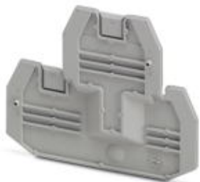
End cover, length: 69.9 mm, width: 2.2 mm, height: 57.5 mm, color: gray

Please be informed that the data shown in this PDF Document is generated from our Online Catalog. Please find the complete data in the user's documentation. Our General Terms of Use for Downloads are valid ( http://phoenixcontact.com/download )