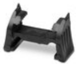
Replacement limit stop

Replacement limit stop - WIREFOX 10/WS - 1200285