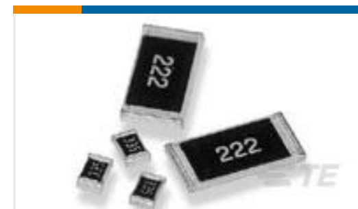
TE Part #1623218-1 CRG0805 1% 3K9