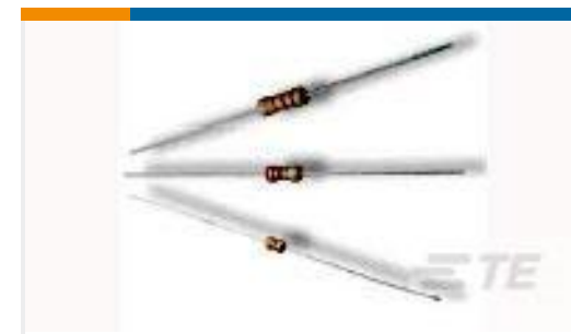
TE Part # 1623932-8 CFR50 5% 10K