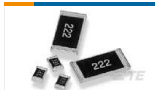
TE Part #1623208-1 CRG0805 1% 390R