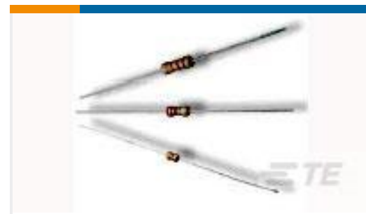
TE Part # 1623927-8 CFR16 5% 120R