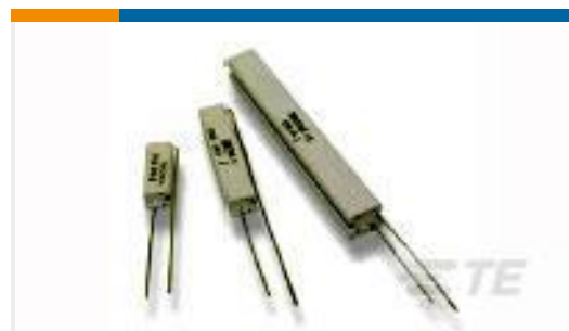
TE Part #1623728-7 BCHE 11 W 1K0 5%