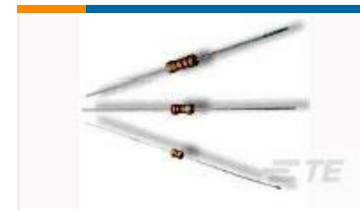
TE Part # 1623925-2 CFR100 5% 100R