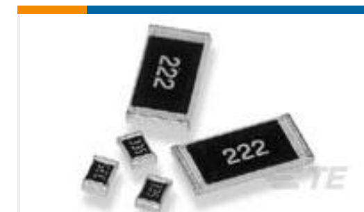
TE Part #1623278-1 CRG0805 1% 6K8