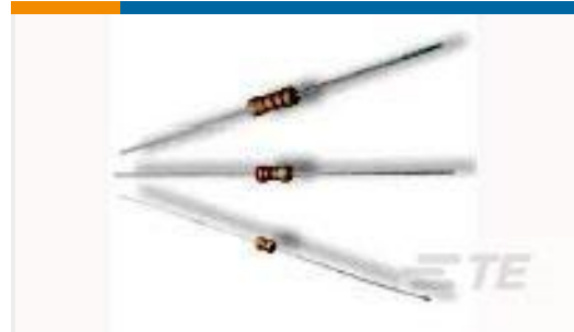
TE Part # 2-1623929-2 CFR200 5% 22K