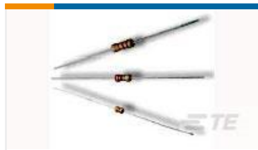
TE Part # 1623930-3 CFR25 5% 10K