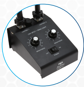
Light Adjustment Knobs for Each Illuminator and On/Off Switch on Metal Base