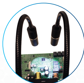
Illuminate and Overlap Spotlights at Any Angle