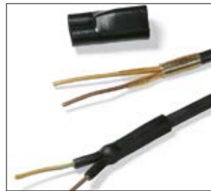
Adhesive tape HMT200A for sealing against humidity.