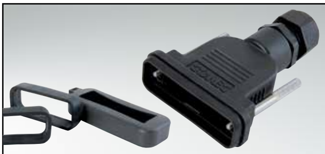
RoHS compliant – CSA listed, File No.: LR 115000-1 – UL listed, File No.: E202784

Straight cable entry – 9-50 pos. – large interior