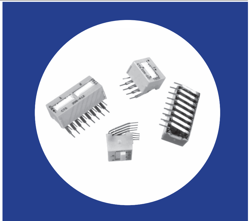
Series 206RA – Premium Gold Plated Contacts Series 208RA – Economical Tin Plated Contacts