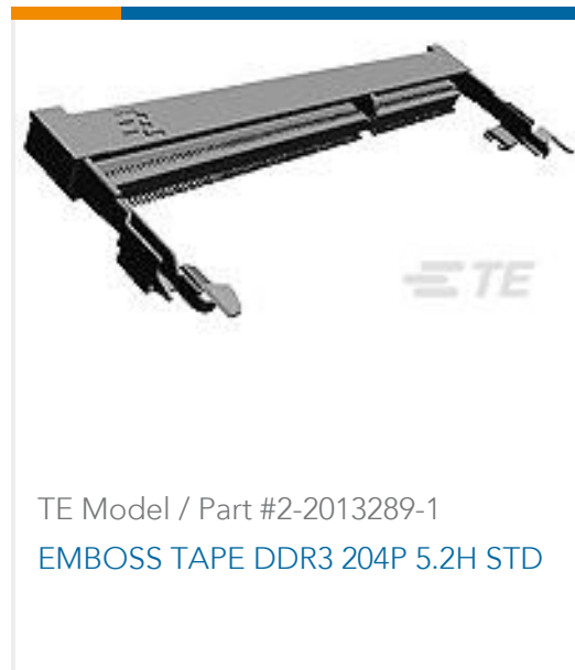
TE Model / Part #2-2013289-1 EMBOSS TAPE DDR3 204P 5.2H STD