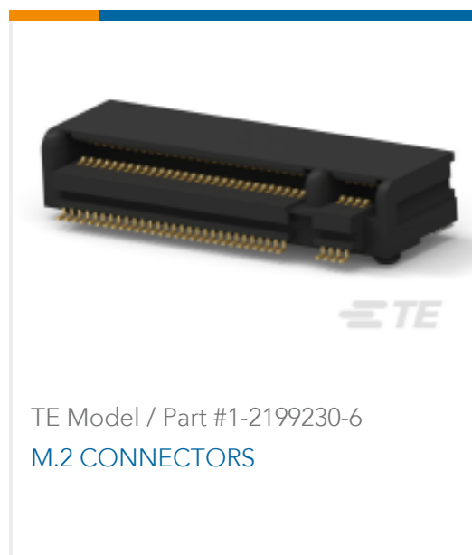
TE Model / Part #1-2199230-6 M.2 CONNECTORS