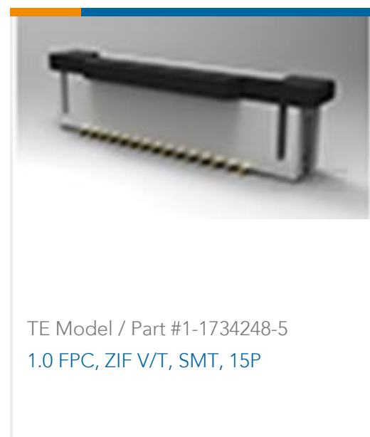
TE Model / Part #1-1734248-5 1.0 FPC, ZIF V/T, SMT, 15P