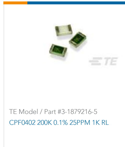
TE Model / Part #3-1879216-5 CPF0402 200K 0.1% 25PPM 1K RL