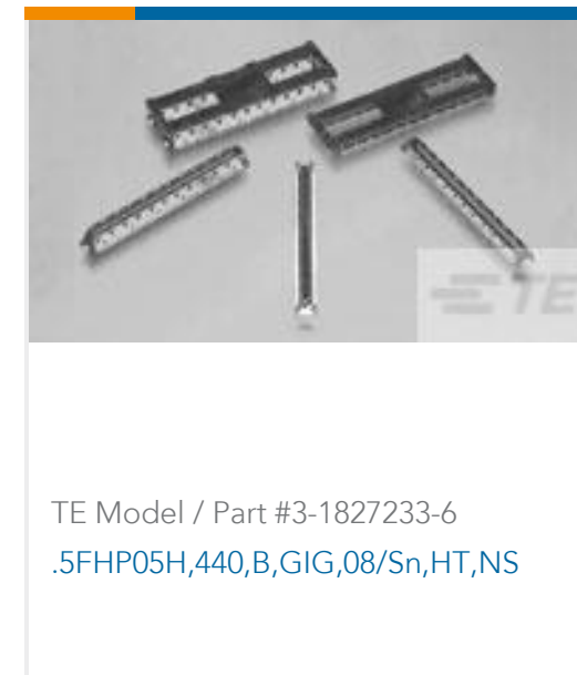
TE Model / Part #3-1827233-6 .5FHP05H,440,B,GIG,08/Sn,HT,NS