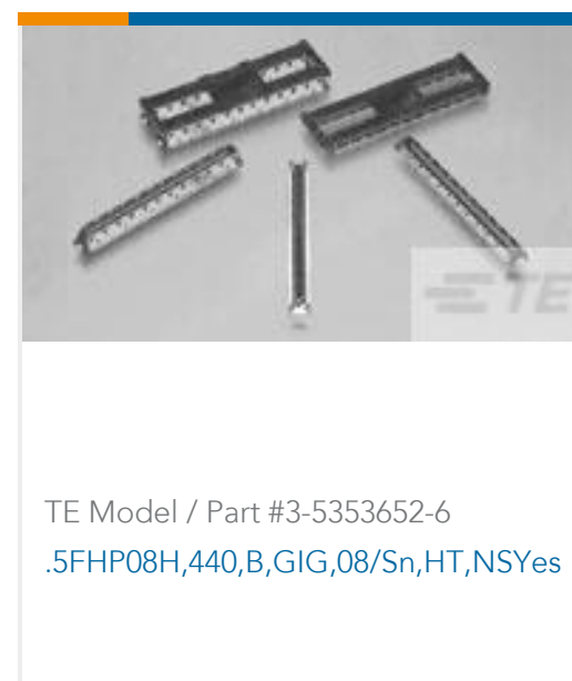
TE Model / Part #3-5353652-6 .5FHP08H,440,B,GIG,08/Sn,HT,NSYes