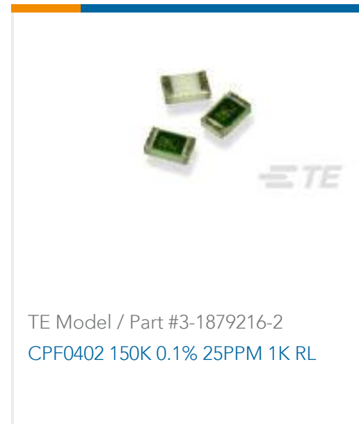
TE Model / Part #3-1879216-2 CPF0402 150K 0.1% 25PPM 1K RL