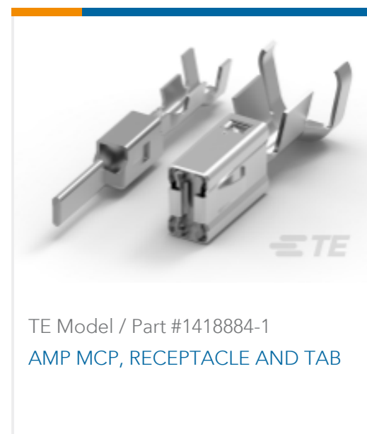
TE Model / Part #1418884-1 AMP MCP, RECEPTACLE AND TAB