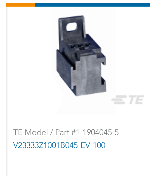
TE Model / Part #1-1904045-5 V23333Z1001B045-EV-100