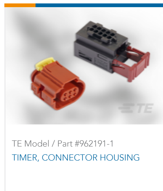
TE Model / Part #962191-1 TIMER, CONNECTOR HOUSING