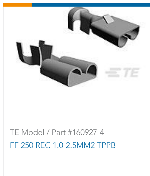
TE Model / Part #160927-4 FF 250 REC 1.0-2.5MM2 TPPB