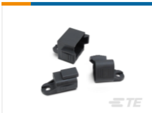
TE Model / Part #1011-345-0305 DEUTSCH DT DUST CAPS