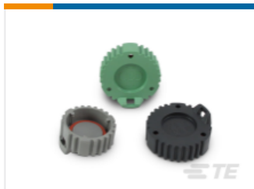
TE Model / Part #HDC16-9 DEUTSCH HD10 RECEPTACLE DUST CAPS