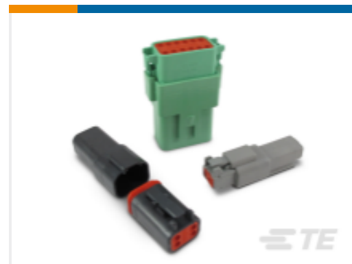
TE Model / Part #DT04-3P-P006 DEUTSCH DT HOUSINGS