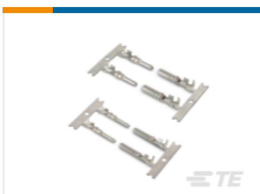
TE Model / Part #1060-20-0144 DEUTSCH STAMPED & FORMED CONTACTS