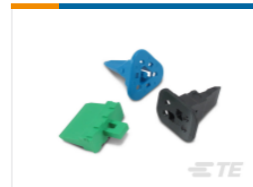
TE Model / Part #W3S-1939 DEUTSCH DT WEDGELOCKS