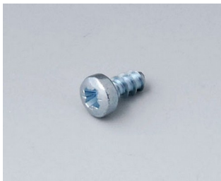
A0306031 Self-tapping screws 3 x 6 mm (PZ1)