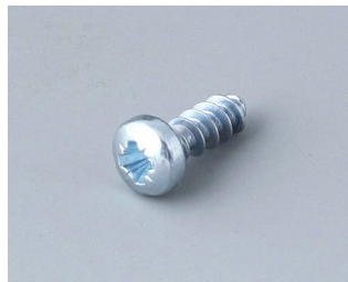
A0308031 Self-tapping screws 3 x 8 mm (PZ1)