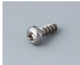
A0308132 Self-tapping screw 3 x 8 mm (T10) Stainless steel

Subject to technical modification without notice. © by OKW Gehäusesysteme, Buchen/Germany.