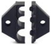
Spare die for CRIMPFOX-RC 25

Replacement die - CRIMPFOX-RC 25/DIE - 1212299