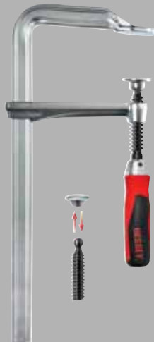
Original BESSEY all-steel screw clamp GZ with swivel handle