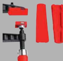
Pressure cap strips SKS (2 pcs./bag)