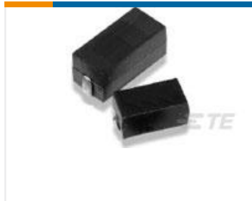
TE Part #3-1879021-5 SMW3 2R7 5%