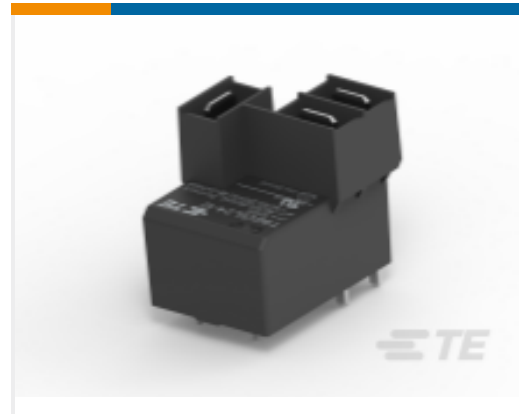
TE Part #1558675-3 T9GS5L24-12