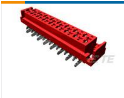
TE Part #8-338069-8 MICRO-MATCH SMD FTE