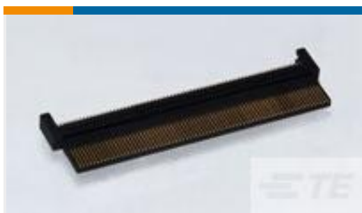
TE Part #2057629-1 CFP Module Conn Assy