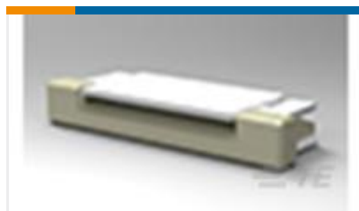
TE Part #1-1734839-8 FPC CONN. 0.5MM PITCH T/C,18P